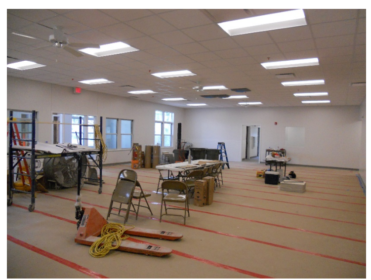
New dinning room